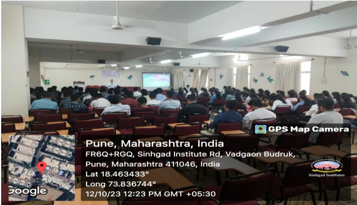
ICT Facilities in the Syndicate Room